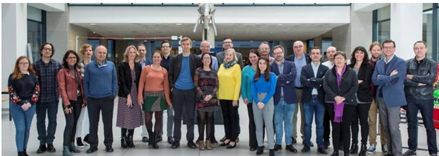
Attendants of the ETHNA kick-off meeting, with the participation of the director of CTS

• RRI, including research ethics, on all activities of research and publication. • RRI, including research ethics, for advanced training, namely PhD program, and organization and evaluation of scientific and dissemination events. • RRI, including research ethics, on all activities of technology transfer and collaboration with industry and other societal actors.