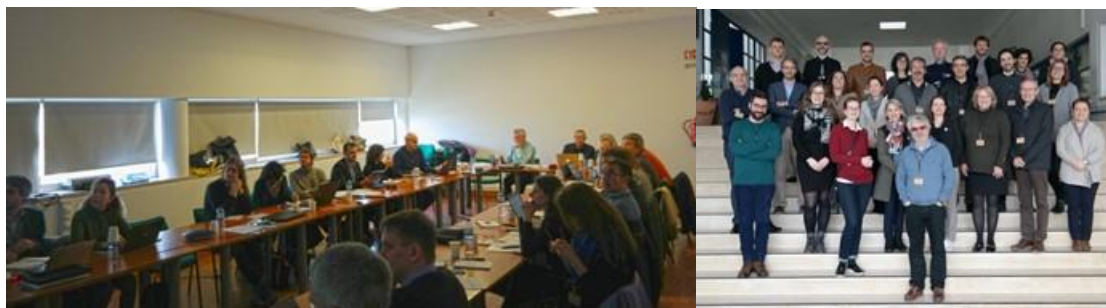
Kick-off meeting of the IMPACTOUR project at FCT/UNL, with all 12 project partners

IMPACTOUR will develop a sustainable ecosystem by engaging Cultural Tourism stakeholders and following a participatory approach. IMPACTOUR tools and methods will lead to reinforcing the commitment to enhance Europe as a cultural tourism destination, increasing local citizens' sense of belonging, promoting minority cultures, strengthening identities and sense of belonging. IMPACTOUR Methodology will be completed and tested with data coming from 15 Data Information Pilots and the IMPACTOUR tool will be validated in 5 Validation Pilots, with distinct characteristics spread around Europe.